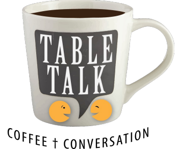
Table Talk will return in the Fall.

Mark your calendars for the return of the