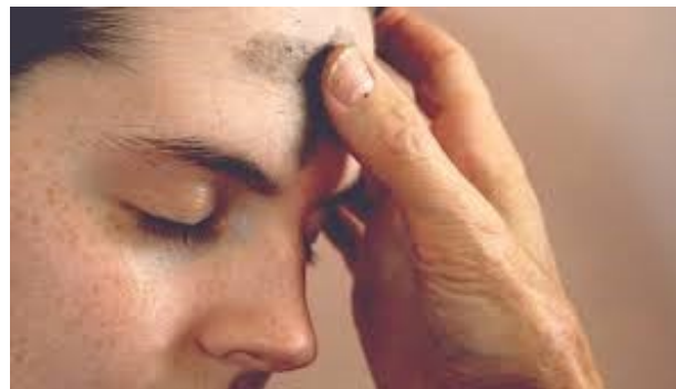
This year, Ash Wednesday, is February 26, 2020 with worship at 7:00PM.