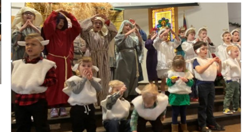
Children's Christmas Program