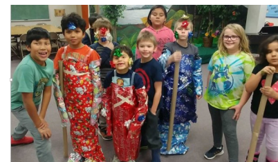
Kids for Christ